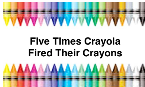
Five Times Crayola Fired Their Crayons