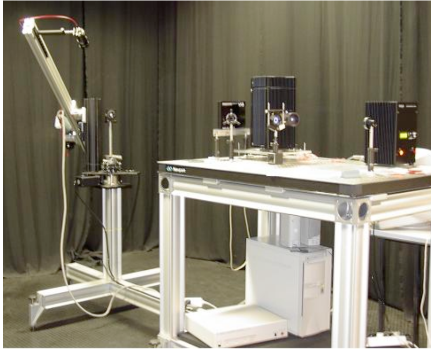
Fig. 1 Picture of the BSRDF goniospectroradiometer